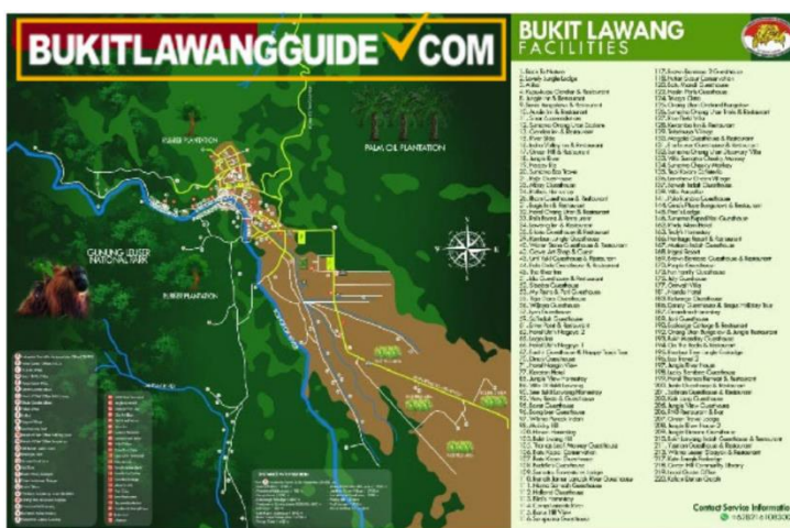
Figure 1. Bukit Lawang Guide

The threat indicator refers to situations that may negatively impact the organization, particularly the Bukit Lawang ecotourism area. Such threats could lead to setbacks and losses in both the short and long term, especially concerning the development of ecotourism in Bukit Lawang. Identified threats include areas for improvement in Bukit Lawang’s ecotourism development, with a focus on enhancing infrastructure to encourage repeat visits from tourists. Additionally, the excessive presence of makeshift blue-tarp shelters along the Bukit Lawang riverside detracts from the aesthetic appeal of the ecotourism site. Addressing this issue falls under the responsibility of the local government, specifically the Langkat Regency Tourism and Culture Office, to provide guidance, recommendations, and viable solutions for improvement.