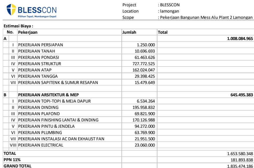
Table 1. Project Data