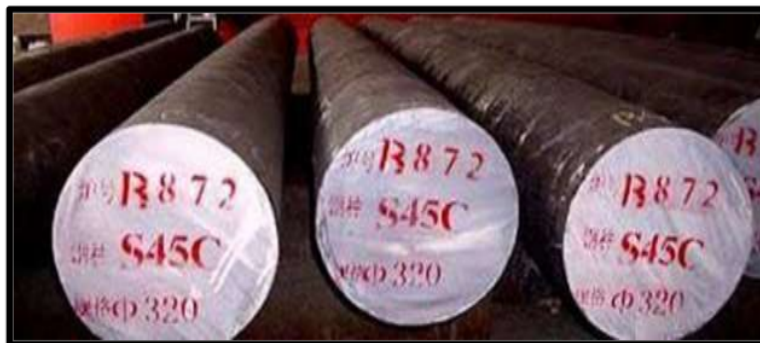
Figure 2. Material Casting S45C

S45C carbon steel is a medium quality steel with a carbon content of 0.42-0.48%, silicon 0.15 – 0.35%, manganese 0.6 – 0.9%, phosphorus 0.03%, sulfur 0.03% , maximum 0.2% chrome, maximum 0.2% nickel, and maximum 0.3% copper.