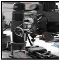
Figure 3. Drilling Machine

The next process is process Drilling where this process expands/enlarges the hole which can be done with a drilling bar (boring bar) used to make round holes. Process drilling This uses a drilling machine Drilling 32mm Westlake. The size of the hole to be made is 4 mm.