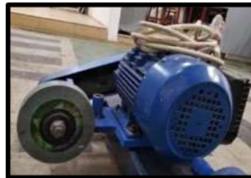
Figure 3. Grinding machine

The next process is the process Grinding that is part of the process finishing which is used to remove uneven parts of the workpiece. Where this process is used to smooth parts of the turning process. Grinding machines are more appropriate to use than other machines, because grinding machines are used for the final process (finishing). The smoothing process takes about 4 minutes.