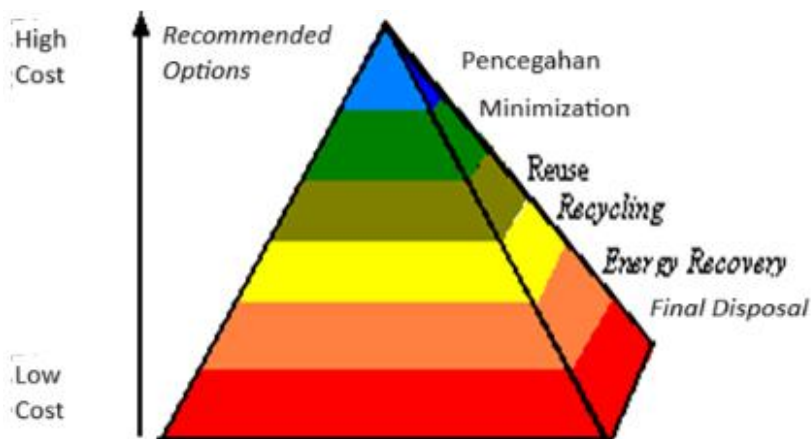
Figure 2. Waste Management Hierarchy

Recycling is defined as the process of collecting, separating, processing, and selling materials that can be reused or converted into new materials (Hidayah, 2018). In integrated waste management, recycling is a key component, as illustrated in the hierarchy shown in Figure 2.4 below.