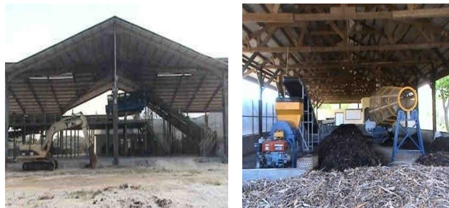
a) City-scale MRF location