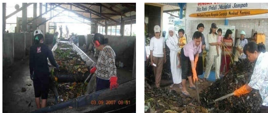
a) Waste Separation